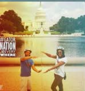
Ulysses S. Grant Memorial

These gators chomp in front of the Ulysses S. Grant Memorial and the Capitol Hill in Washington, D.C.