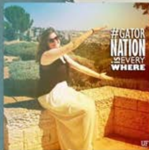
from Foursquare Jerusalem (ירושלים)